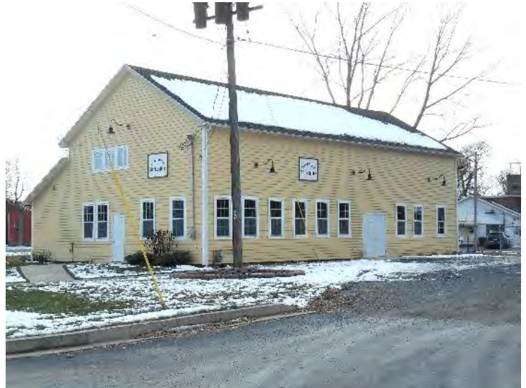
Canal Street Marketplace