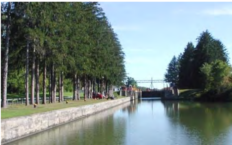
Lock C-7 Canal Park