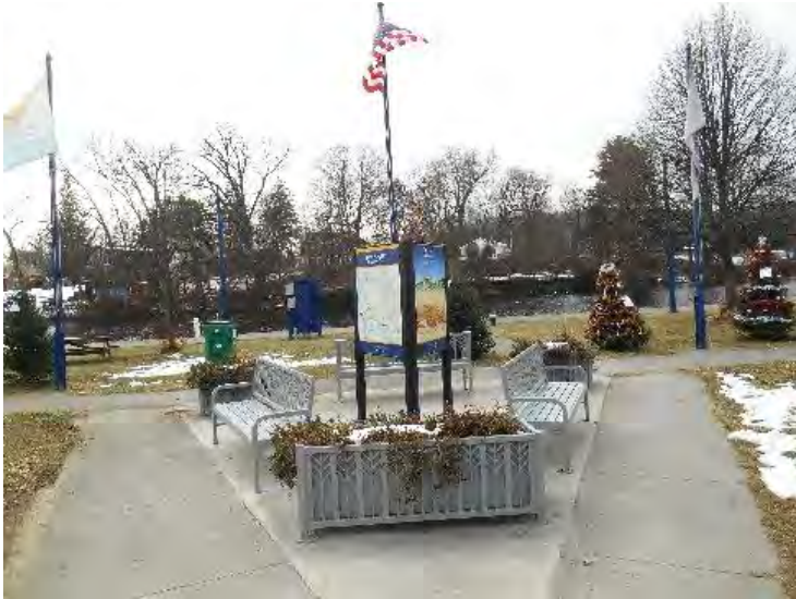
Fort Edward Yacht Basin