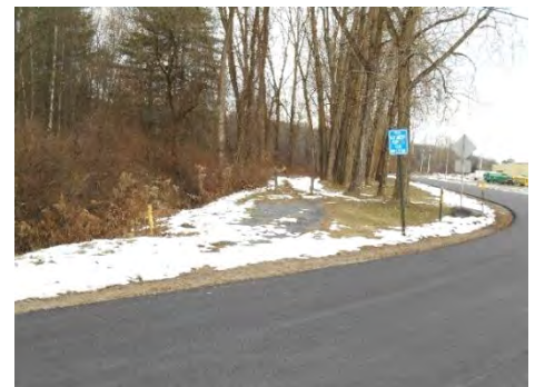
Old Champlain Canal Towpath

Public Facilities: Old Fort House Museum; Rogers Island Visitor Center; Canal Street Market; Mullen Park & Walking-Fitness Trail; Washington County Historical Society; Fort Edward D&H Railway Depot (Amtrak Station); Moses Kill Aqueduct; Fort Edward Junction Lock; Washington County Grasslands Important Bird Area; and Fort Edward Yacht Basin and Terminal Wall.