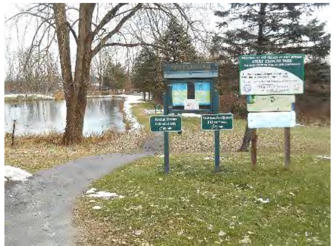
Mullen Park Fitness Trail