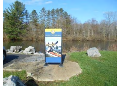
Old Champlain Canal Lock 13 Pocket Park

Trail Description: Known as the "Great Carrying Place", Fort Edward is steeped in rich history and heritage having played a major role in the French and Indian Wars and the American Revolution. Fort Edward has the advantage of being located at the entrance of the Hudson River and Champlain Canal, being located near Highway I-87 and having major railroad access while retaining the historic and country charm of a rural community. The CCT will take advantage of this strategic location by highlighting Hudson River views and access points in its southern approach from the Town of Greenwich. As the trail continues into the Village of Fort Edward it will move onto the Old Champlain Canalway route which becomes the critical connector to the Feeder Canal and the Upper Hudson River. This route conveys an entire interpretive story can be from the Old Junction Lock to the Five Combines Park area.