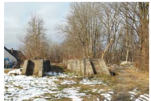
Old Champlain Canal Junction Lock

Empire State Trail: The EST will exist entirely on Route 4 as an on-road shoulder route throughout the Town of Fort Edward. It will follow the CCT route throughout the Village of Fort Edward and to its border with Kingsbury. NYSDOT will be responsible for roadside signage, striping and wayfinding enhancements. Route 4 will continue to serve as an on-road bicycle route.