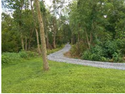
Surrender March North Trailhead