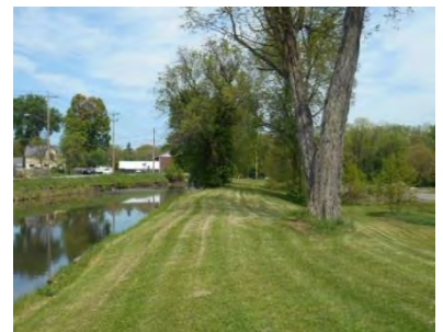
Fort Hardy Park