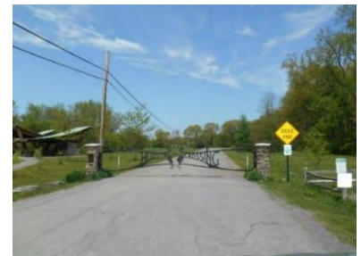
Hudson Crossing Park