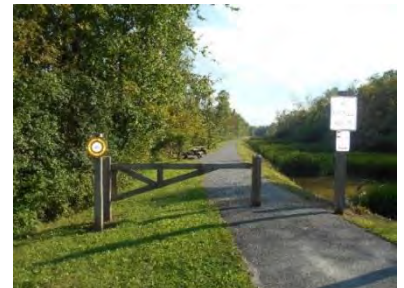
Wilbur Road Trail