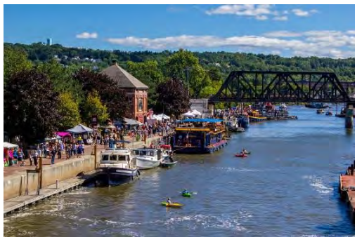
Tugboat Round Up

Trail Description: Waterford, located at the junction of the Hudson River, Champlain Canal, Mohawk River and Erie Canal, is the start of the Champlain Canalway Trail. The Champlain Canalway Trail is entirely located along the Old Champlain Canal and is nearly fully developed throughout the Town and Village of Waterford. The trail runs from Old Champlain Lock 4 at the southern point of the Town and just east of Route 32. It continues north along the Old Champlain Canal for about 1.25 miles to the 4th Street Bridge into the Village. The trail continues from the Erie Canal Lock 2 Park north for about 0.35 miles before it reaches the Village border just after the Old Champlain Canal Weighlock and the overhead railroad bridge. It then continues north for about 1.9 miles to the Town's border with the Town of Halfmoon.