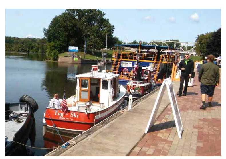
Waterford Harbor Visitor Center Waterfront Dock