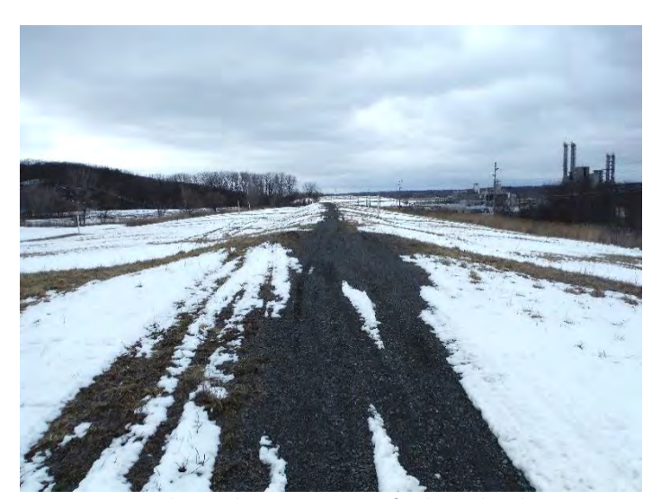
Trail near Clute Street West of Industrial Park