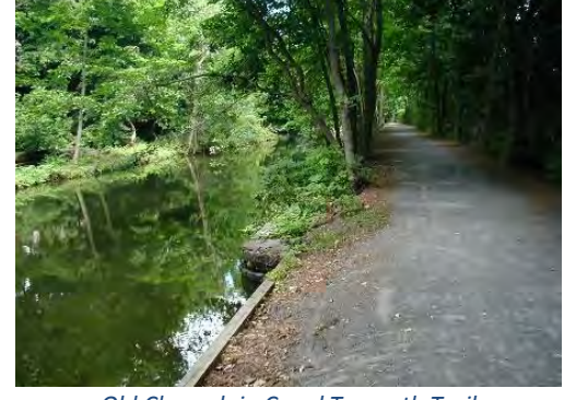
Old Champlain Canal Towpath Trail

Public Facilities: Waterford Harbor Visitor Center; Waterford Historical Museum and Cultural Center; Urger Canal Tugboat historic teaching & touring vessel); Peebles Island State Park; Erie Canalway National Heritage Corridor Visitor Center; Flight of Locks; Lock E2 and E6 State Canal Parks; Old Champlain Canal Locks 4 and 5; Old Champlain Canal Weighlock; and Old Champlain Canal Sidecut Locks.