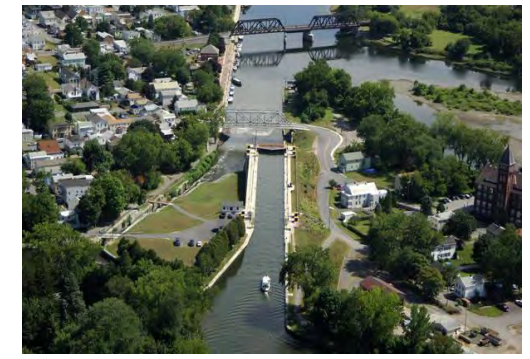
Flight of Locks

Mohawk-Hudson Bike-Hike Trail: A Bike-Hike Trail connecting Albany and Schenectady Counties on the south side of the Mohawk River to the Erie Canal Trail. Peebles Island State Park: Peebles Island Loop Trail.