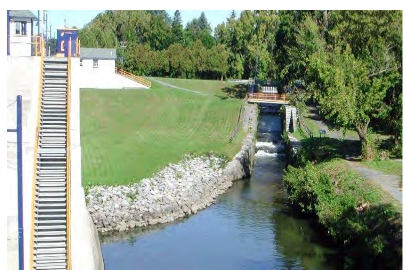
Old Champlain Canal Side-cut Locks