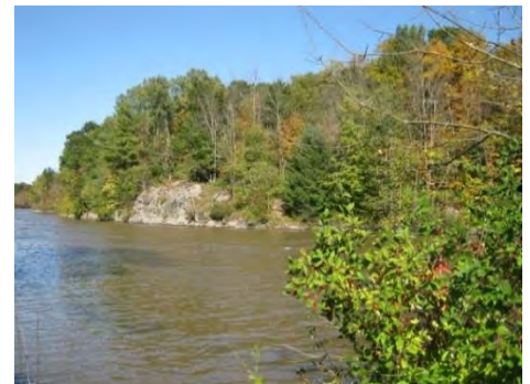
Champlain Canal North of Clay Hill Bridge

Implementation Strategy: Funding is in place for the entire route through Fort Ann with construction slated for 2019-2020. Work includes improving the Fort Ann Towpath Trail with a stone dust surface. Contractors will work with the local snowmobile club to avoid winter conflicts.