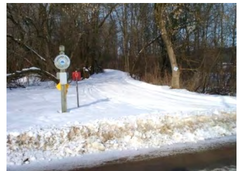
Fort Ann Towpath Trail at Baldwins Corners