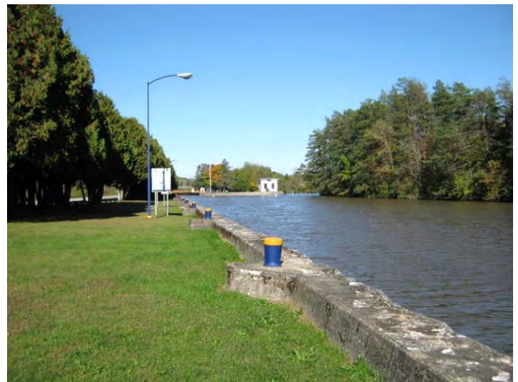
Lock 11 Canal Park