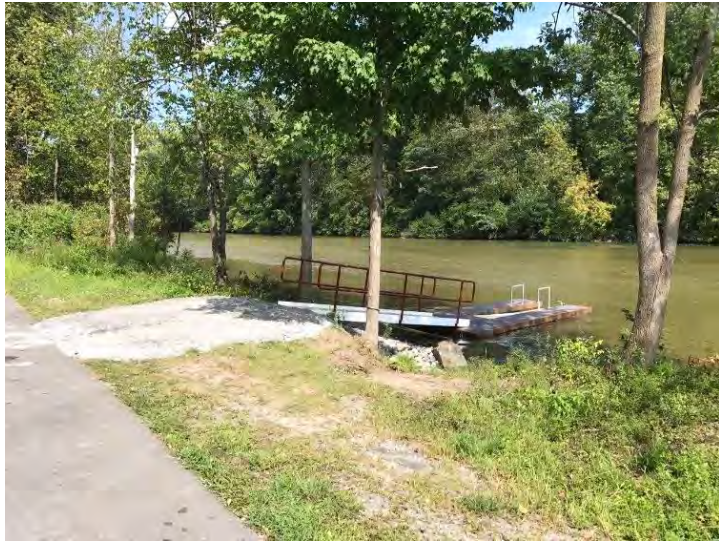
Fort Ann Waterfront Park Kayak Launch