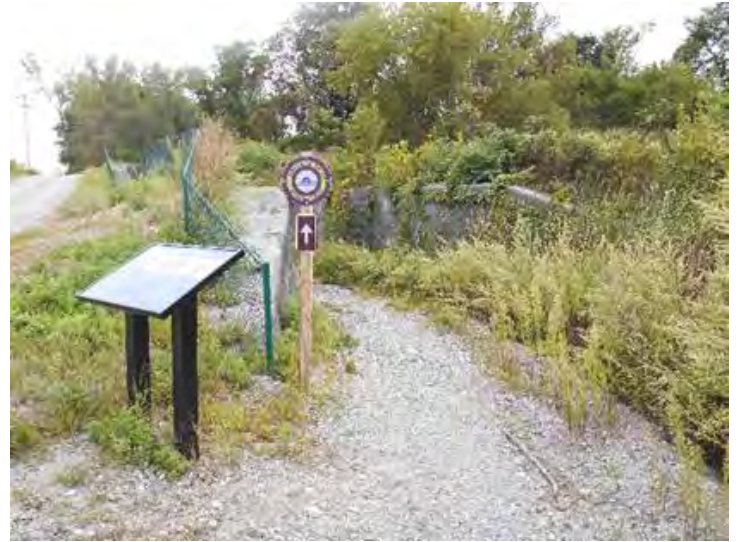
Fort Ann Towpath at Ann Street