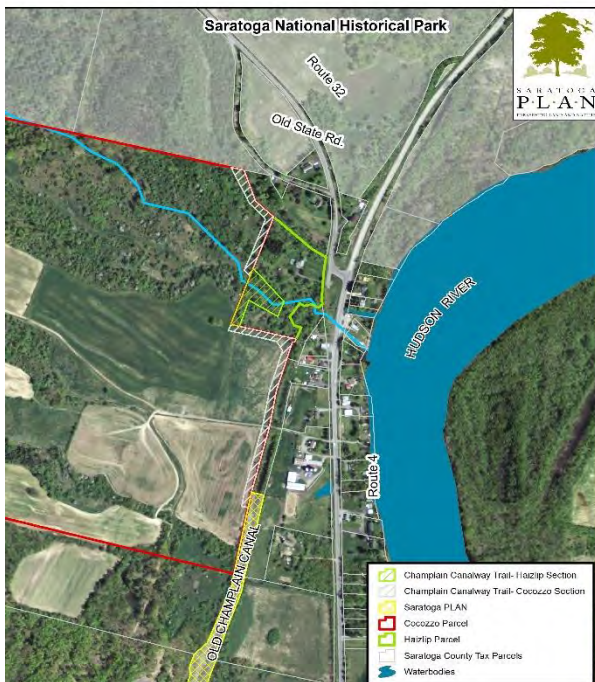
Town of Stillwater Northern Trail Route

Status: Completed as a turf trail with future plans as a stone dust surface. The section of trail on Town of Stillwater lands is presently a rough but walkable footpath. This section is anticipated for improvement to a stone dust trail.