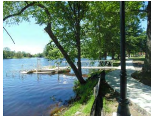
Riverfront Town Park

Trail Description: The Town of Stillwater has been actively completing sections of the Stillwater Multi-Use Trail. When complete, the trail will span approximately 5 miles connecting the City of Mechanicville with the Town of Saratoga. Completed trail sections include the Campbell Park Trail, the Stillwater Multi-Use Trail (Phase 1), and the Saratoga National Historic Park Trail. The trail primarily follows the historic Old Champlain Canal towpath. The southern section provides a greater integration of the Stillwater Junction and Riverside communities and will serve as a gateway into Stillwater from Mechanicville and the Zim Smith Trail. A central trail loop runs through the heart of the Village downtown connecting neighborhoods with local amenities and the Hudson River.