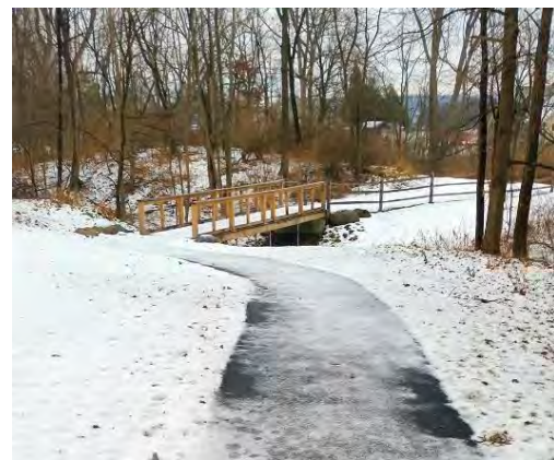
Stillwater Multi-Use Trail

Empire State Trail: State Bike Route 9 along Route 4 will continue as an on-road marked bicycle route and serve as the route for the Empire State Trail. The road will be marked and signed for bicycling.