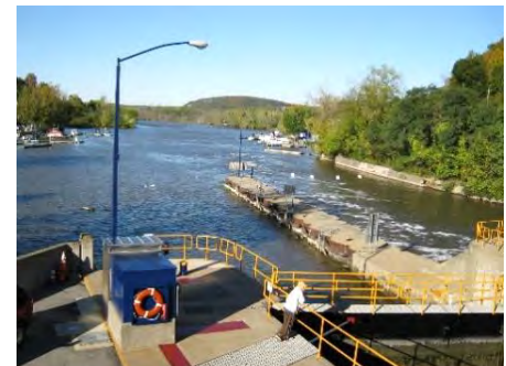
Lock 12 Looking North

Lake Champlain/Champlain Canal Access Points: Lock C12; South Bay State Boat Launch; South Bay Fishing Pier; Whitehall Harbor Boat Ramp; The Saddles State Park; and Dolph Pond State Forest.