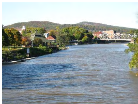
Whitehall Harbor Boat Ramp

Phase: Funding for surveying, archeological review, environmental analysis, permitting and design of this segment is provided through a 2017 LWRP NYSDOS grant. Construction budget and funding is to be determined. Permissions to purchase or grant easements for a trail will need to be negotiated.