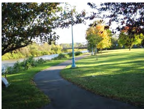
Whitehall Cultural Park