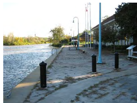
Whitehall Terminal Wall