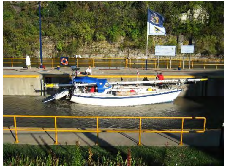
Sailboat in Lock 12