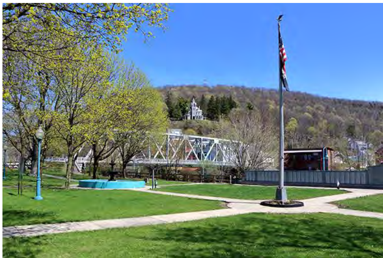
Skene Manor overlooks Skenesborough Park