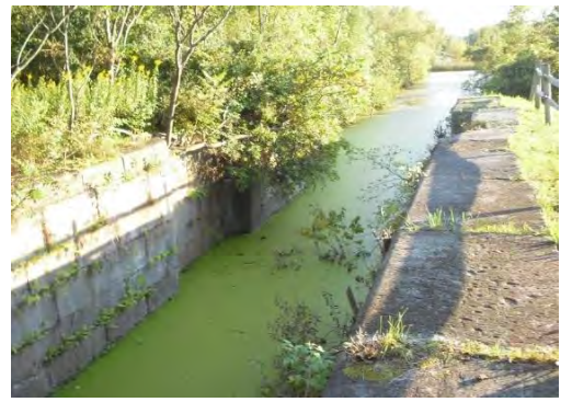
Old Champlain Canal and Towpath

Implementation Strategy: Complete design, engineering and construction underway for Upper Newtown Road to Farm to Market Road/Route 146. Seek a rural connection from the trail's north terminus northwest to the Zim Smith Trail near Elizabeth Street in Mechanicville. Obtain necessary permits and construct required road and railroad track crossings.