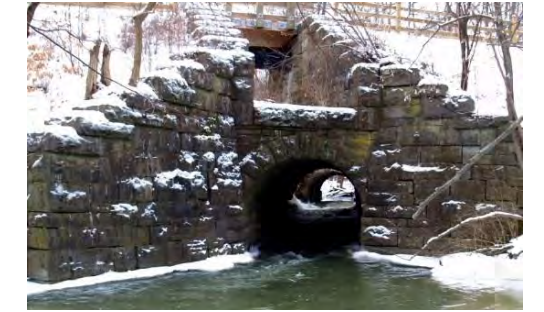
Old Champlain Canal Historic Waste Weir at McDonald's Creek

CHAMPLAIN CANALWAY TRAIL 2019 ACTION PLAN