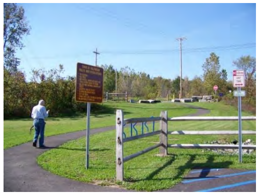
Brookwood Road Trailhead

Trail Description: The Town of Halfmoon is a rural residential bedroom community of over 23,000 residents. The Town's demography has led to the expanding demand for hiking and biking trails that serve as connectors to all of the Town's recreational assets and open spaces. The Town's trail system includes three distinctive sections along the Champlain Canal/Hudson River. When complete, this corridor will contain a continuous 6-mile stone dust hike/bike trail. The first two segments are entirely completed and form a continuous 4-mile stone dust trail that is in active use. From the south, it extends north from the southern town border near School House Lane just south of the boundary with Town of Waterford continuing north to Upper Newtown Road. This stone dust trail has uniform wayfinding and instructive signage, including interactive QR code signage and is bordered by wooden fencing. The third trail segment is about 2-miles in length and is in the design stage. A fourth segment, now under development, is a connector trail from the Brookwood Road trailhead to Lighthouse Park.