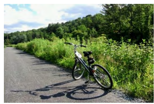
Halfmoon Hike-Bike Trail