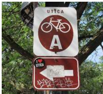
Existing wayfinding signage in Utica

The group navigated a recently-installed pedestrian bridge and traffic roundabout, and rode past critical transportation facilities,