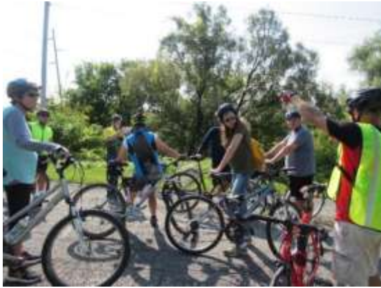
Bike-a-Round participants discuss trail conditions west of Utica

The 8-mile ride began and ended at the Aqua Vino parking lot, which is also the location of Zagster bike share station and a public parking area. From this location, cyclists headed west on the trail towards Harbor Lock and a historically difficult railroad crossing. Participants returned along the same route before heading south along Genesee Street to downtown Utica. They made their way through Utica's Varick Street entertainment district, home to F.X. Matt Brewery and the finish of the famous Boilermaker Road Race, and past important destinations such as the Munson Williams Proctor Arts Institute.