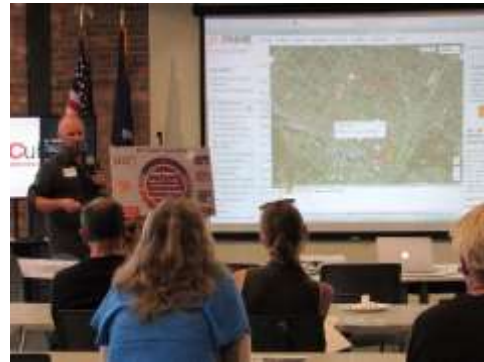
Roundtable participants represented a diverse group of stakeholders

In the discussion following the presentations, Roundtable participants pointed out the need for maintenance on local trail sections, improved signage directing trail users to Downtown Utica, and updated signage for loop routes within Utica.