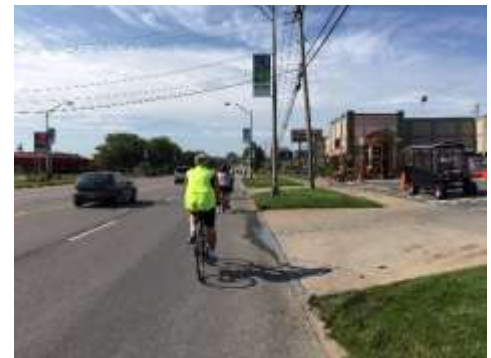
Cyclists navigate North Genesee Street