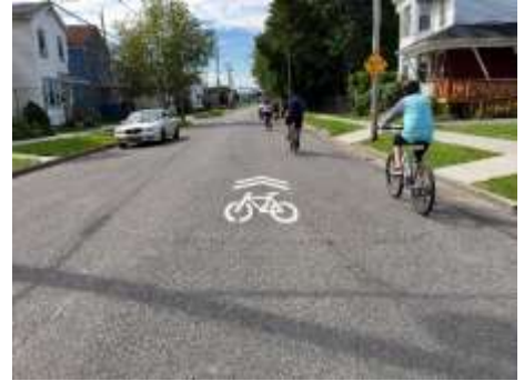
Shared-lane markings on a residential street in Utica