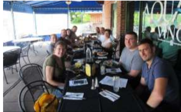
Participants discussing the regional cycling network and enjoying lunch after the Bike-a-Round

They also rode through residential neighborhoods and the historic Bagg's Square district. As the group made their way around, the cyclists referenced checklists found in the Bicyclists Bring Business guide.