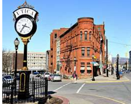
Utica's iconic street clock

Mountains. Downtown Utica is about a mile south of the Mohawk River, the Enlarged Erie Canal, and the Canalway Trail which runs along the Canal. From its intersection with Genesee Street in Utica, the ECT runs 15 miles west to Rome, uninterrupted and off-road save for a short stretch in Oriskany. East of Genesee Street lies one of the ECT's largest