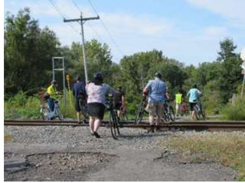
Poor surface conditions on the ECT west of Utica was a common complaint

Other respondents stated that they would like to see more secure bike parking and more police presence in trail areas. Several said that there were clear signs and pavement markings to direct cyclists from the community to the Erie Canalway Trail, but many of the paved areas are not well maintained and/or free of debris.