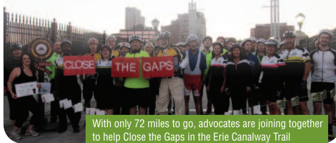
With only 72 miles to go, advocates are joining together to help Close the Gaps in the Erie Canalway Trail

Since the Closing the Gaps campaign was launched in 2010 by PTNY and the Canalway Trails Association New York (CTANY), in conjunction with Senator Kirsten Gillibrand, interest in completing the Erie Canalway Trail among citizens, community leaders, and local, state, and federal government officials has continued to grow. In 2015, 7 more miles of the