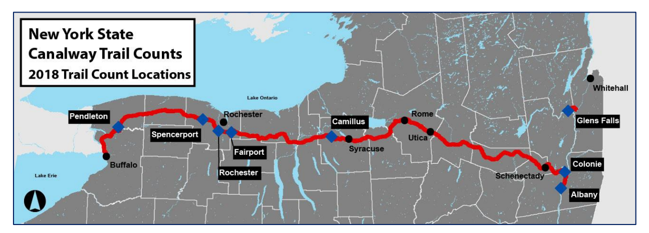
FIGURE 1 - 2018 CANALWAY TRAIL COUNT LOCATIONS

Observational counts occurred in Pendleton (Niagara County) and Camillus (Onondaga County). As in past years, the observational counts were completed during summer months, with at least two hours of usage counted on at least two separate occasions at each site.