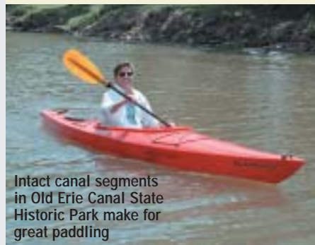
Intact canal segments in Old Erie Canal State Historic Park make for great paddling

Cycling Tips — ⚠️ Take care crossing busy, six-lane Erie Boulevard (Route 5). In Old Erie Canal State Park be prepared to share the trail as horses (and snowmobiles in winter) are permitted.