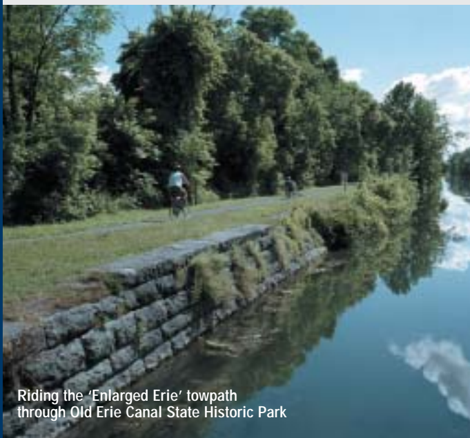
Riding the 'Enlarged Erie' towpath through Old Erie Canal State Historic Park