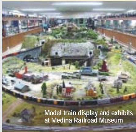
Model train display and exhibits at Medina Railroad Museum

Cycling Tips — A designated bicycle route runs roughly parallel to the canal along the shore of Lake Ontario located about 10 miles to the north. A guidebook is available from the New York State Seaway Trail, a National Scenic Byway (1-800-Seaway).