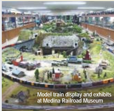
Model train display and exhibits at Medina Railroad Museum

Cycling Tips — A designated bicycle route runs roughly parallel to the canal along the shore of Lake Ontario located about 10 miles to the north. A guidebook is available from the New York State Seaway Trail, a National Scenic Byway (1-800-Seaway).