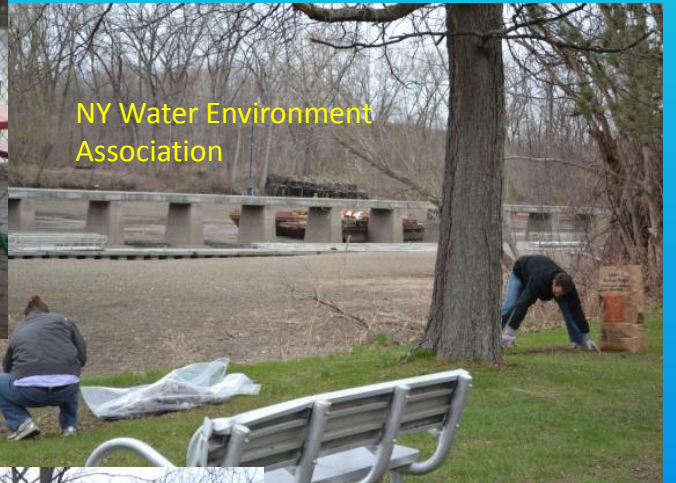
NY Water Environment Association