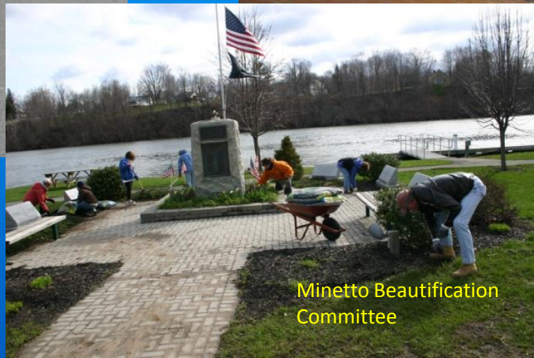
Minetto Beautification Committee