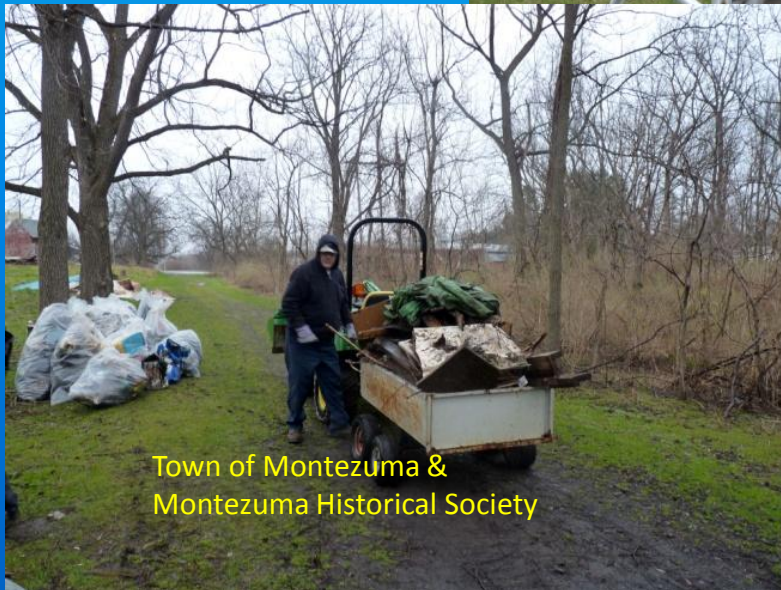
Town of Montezuma & Montezuma Historical Society