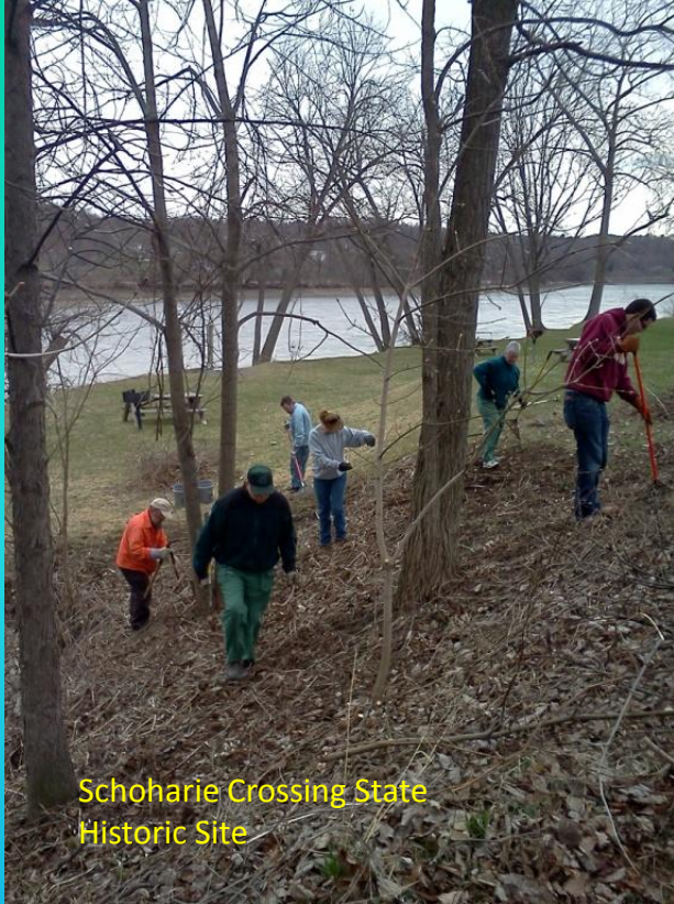
Schoharie Crossing State Historic Site