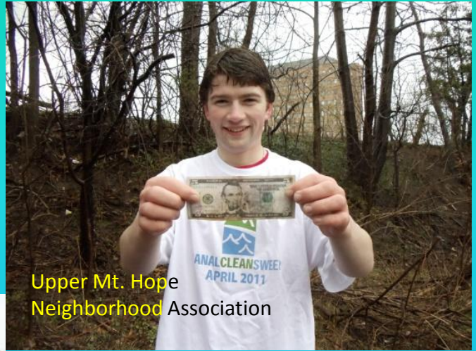
Upper Mt. Hope Neighborhood Association