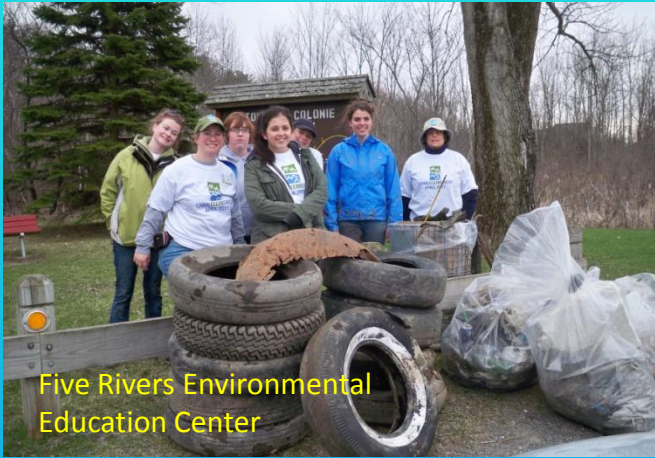
Five Rivers Environmental Education Center

On the designated weekend for the 6 th annual Canal Clean Sweep (4/16 – 4/17), rain fell across the western half of the state. Farther east the rain held off, but cold temperatures predominated. Nevertheless, most of the more than 90 groups participating in the annual “spring cleaning” of the NYS Canal Corridor and the Canalway Trail went ahead as planned. As one volunteer in North Tonawanda said, “Why waste a good day doing this? Now when good weather comes we can enjoy a clean area.” A few groups postponed their events for a day or a week. One event did its clean-up event a day early after checking the forecast!