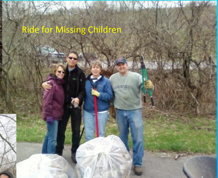
Ride for Missing Children