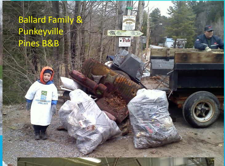
Ballard Family & Punkeyville Pines B&B