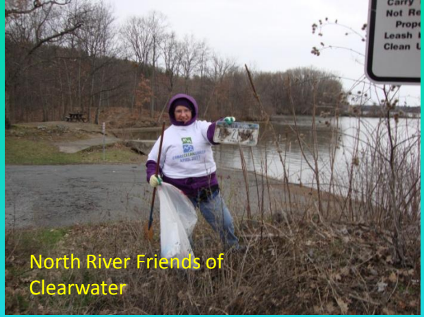
North River Friends of Clearwater