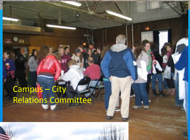
Campus – City Relations Committee