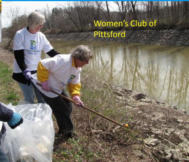
Women's Club of Pittsford