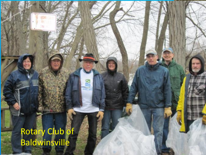
Rotary Club of Baldwinsville