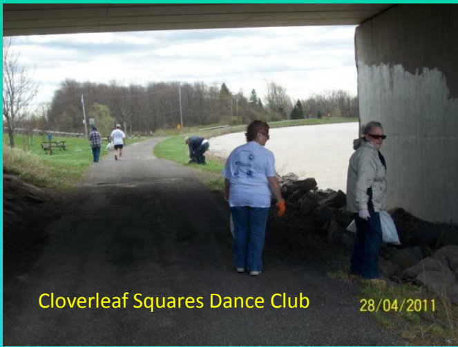
Cloverleaf Squares Dance Club 28/04/2011