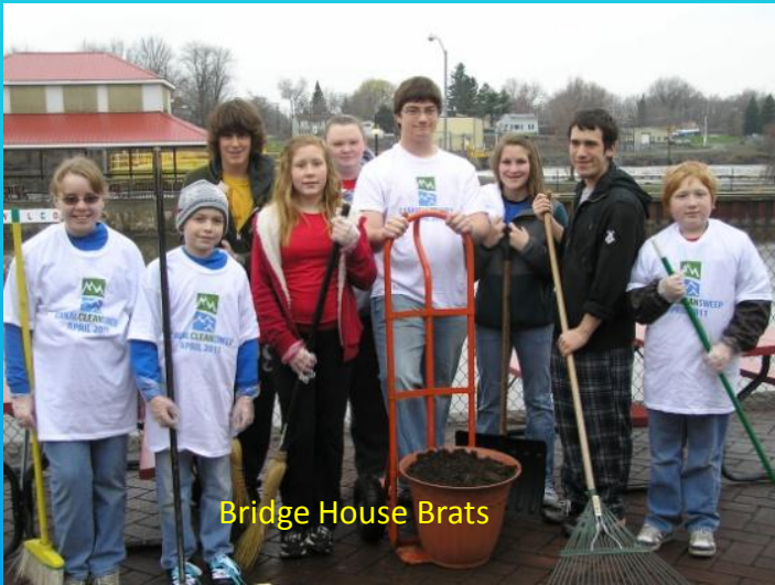
Bridge House Brats