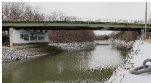
Purchase Image Zoom A mural on the underside of a bridge at Henpeck Park. A trail there got a lot of use.