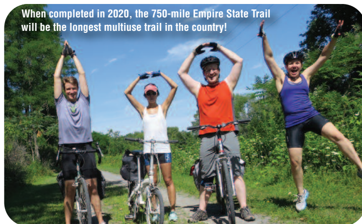
When completed in 2020, the 750-mile Empire State Trail will be the longest multiuse trail in the country!

As the Empire State Trail project moves forward, PTNY will be there every step of the way, helping local communities engage with state agencies, and keeping momentum and enthusiasm for the project going strong.