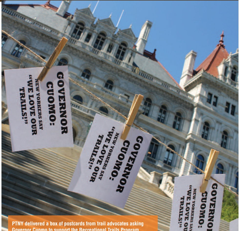
PTNY delivered a box of postcards from trail advocates asking Governor Cuomo to support the Recreational Trails Program

PTNY advocacy, including a very successful postcard campaign, helped preserve the popular Recreational Trails Program (RTP), a vital funding source for trails in NYS.