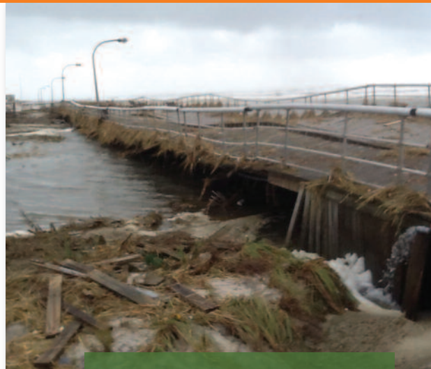
Jones Beach and other state parks experienced significant damage from Hurricane Sandy

While it is too early for detailed damage estimates, restoration of the region's parks and trails will probably end up costing upwards of $100 million dollars. Our thoughts are with the many people and places affected by the storm and our hope is for a speedy recovery.