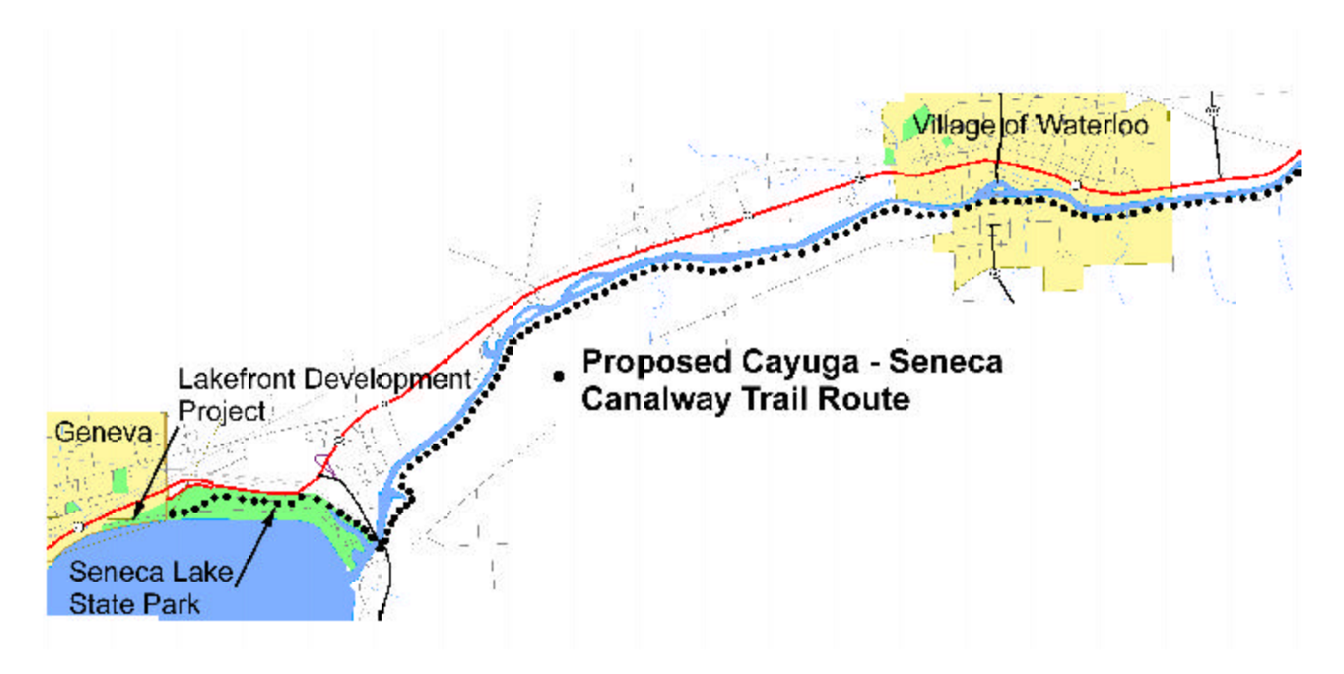
Figure 4 Cayuga - Seneca Proposed Canalway Trail Route (Western Section)